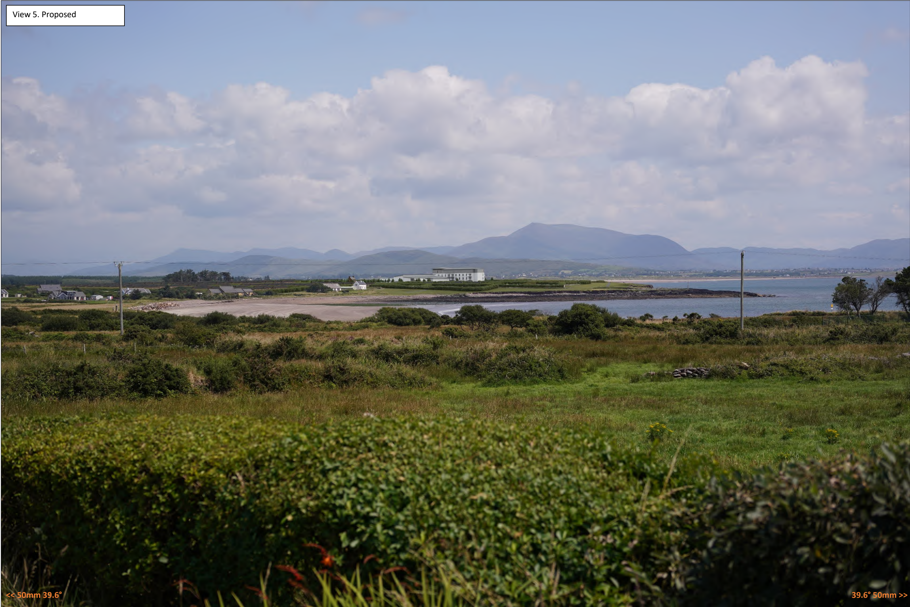
View 5. Proposed