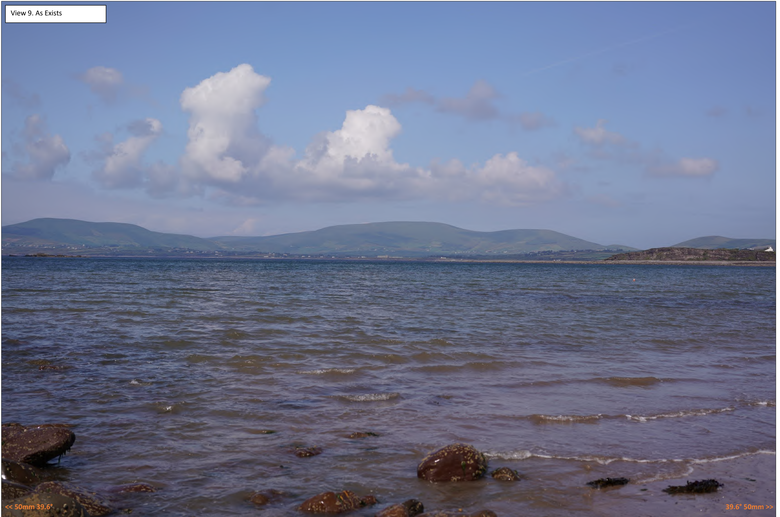
View 9. As Exists