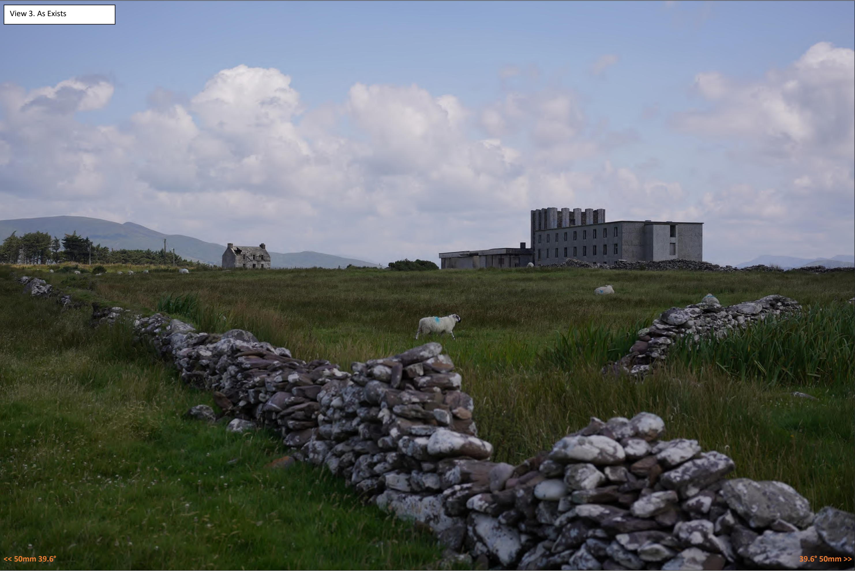
View 3. As Exists