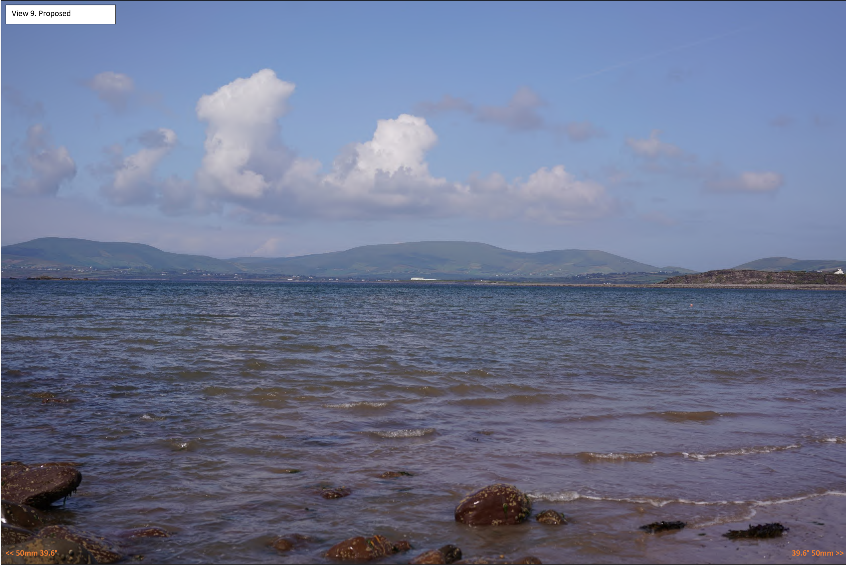
View 9. Proposed