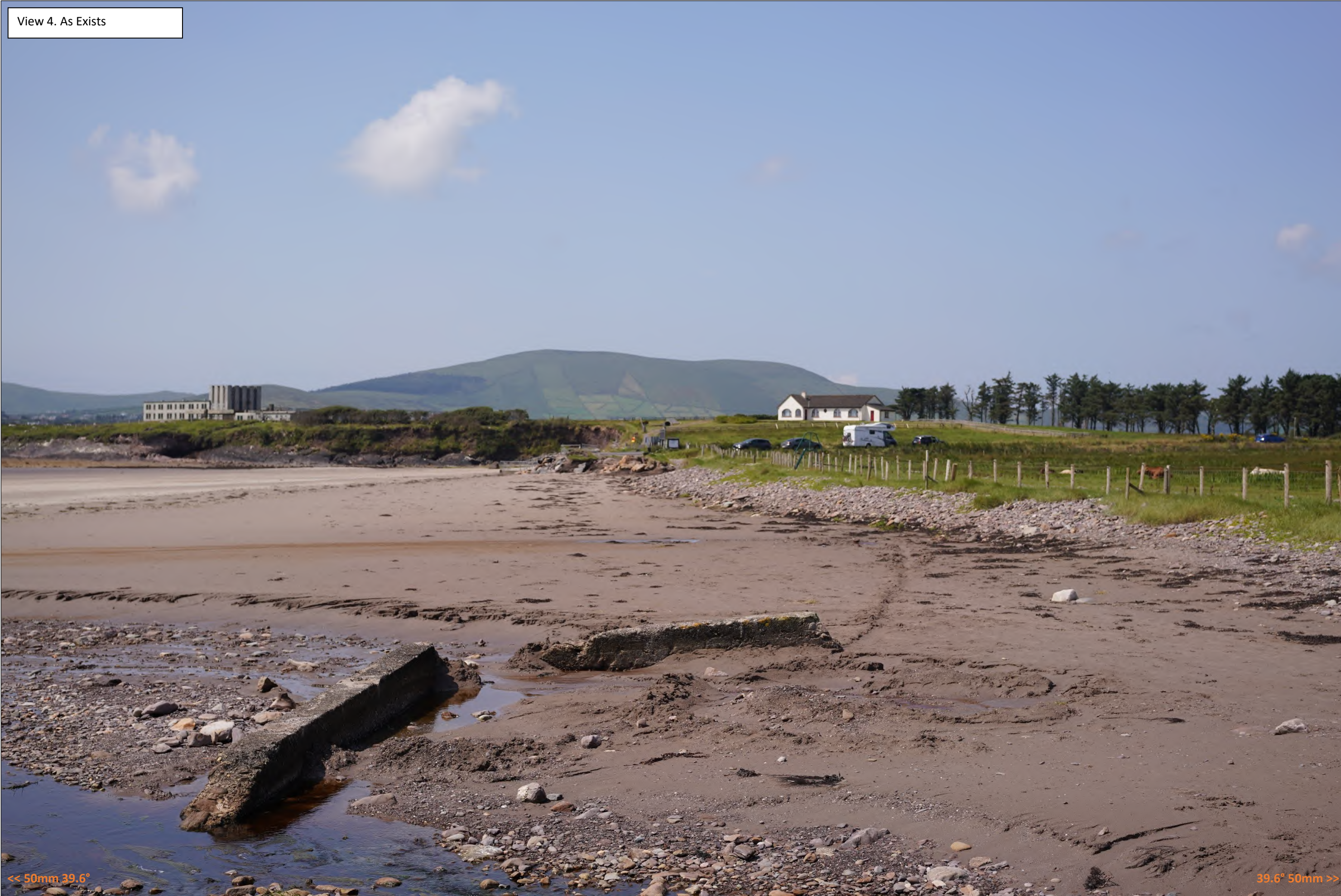
View 4. As Exists