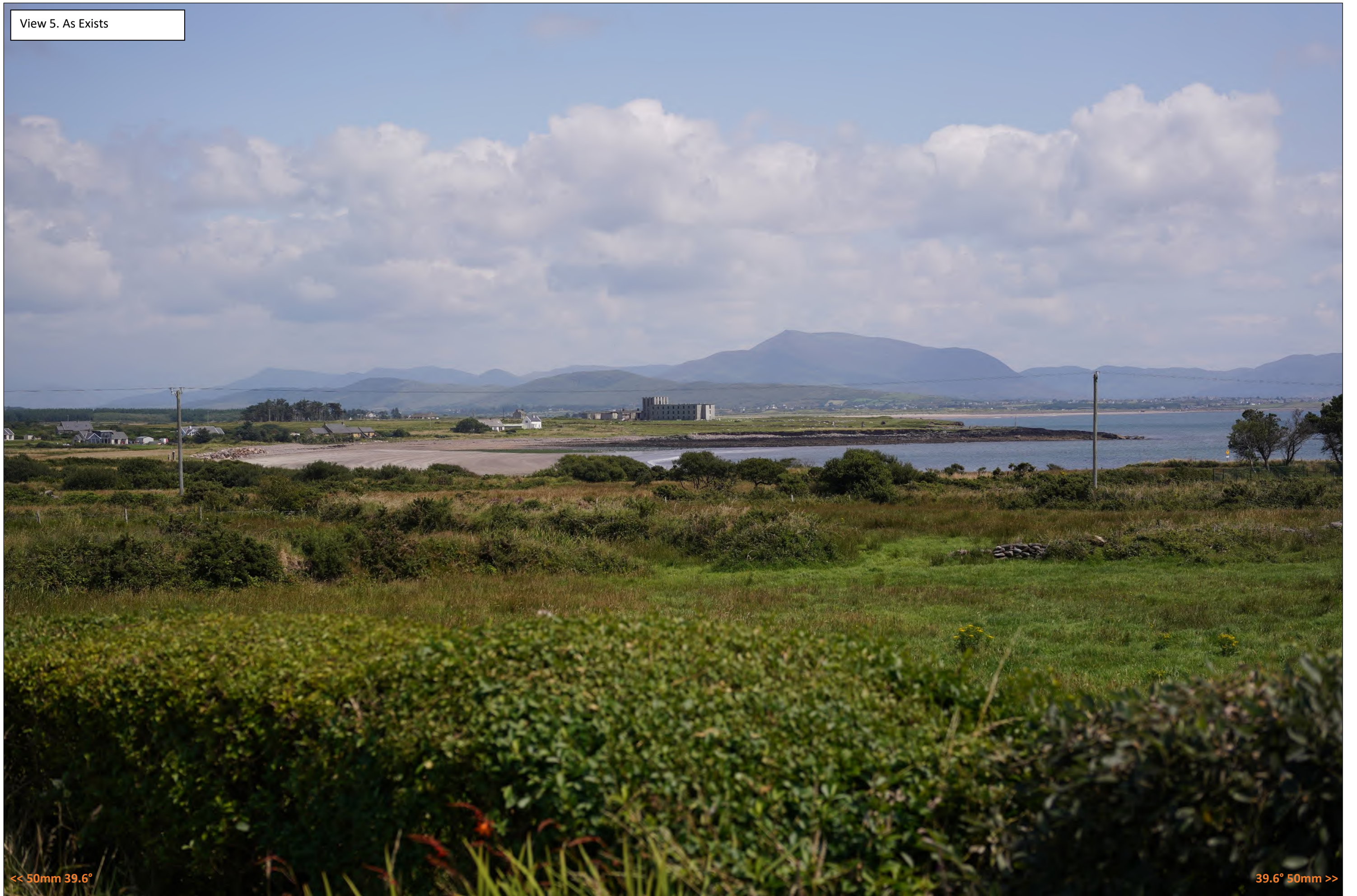
View 5. As Exists