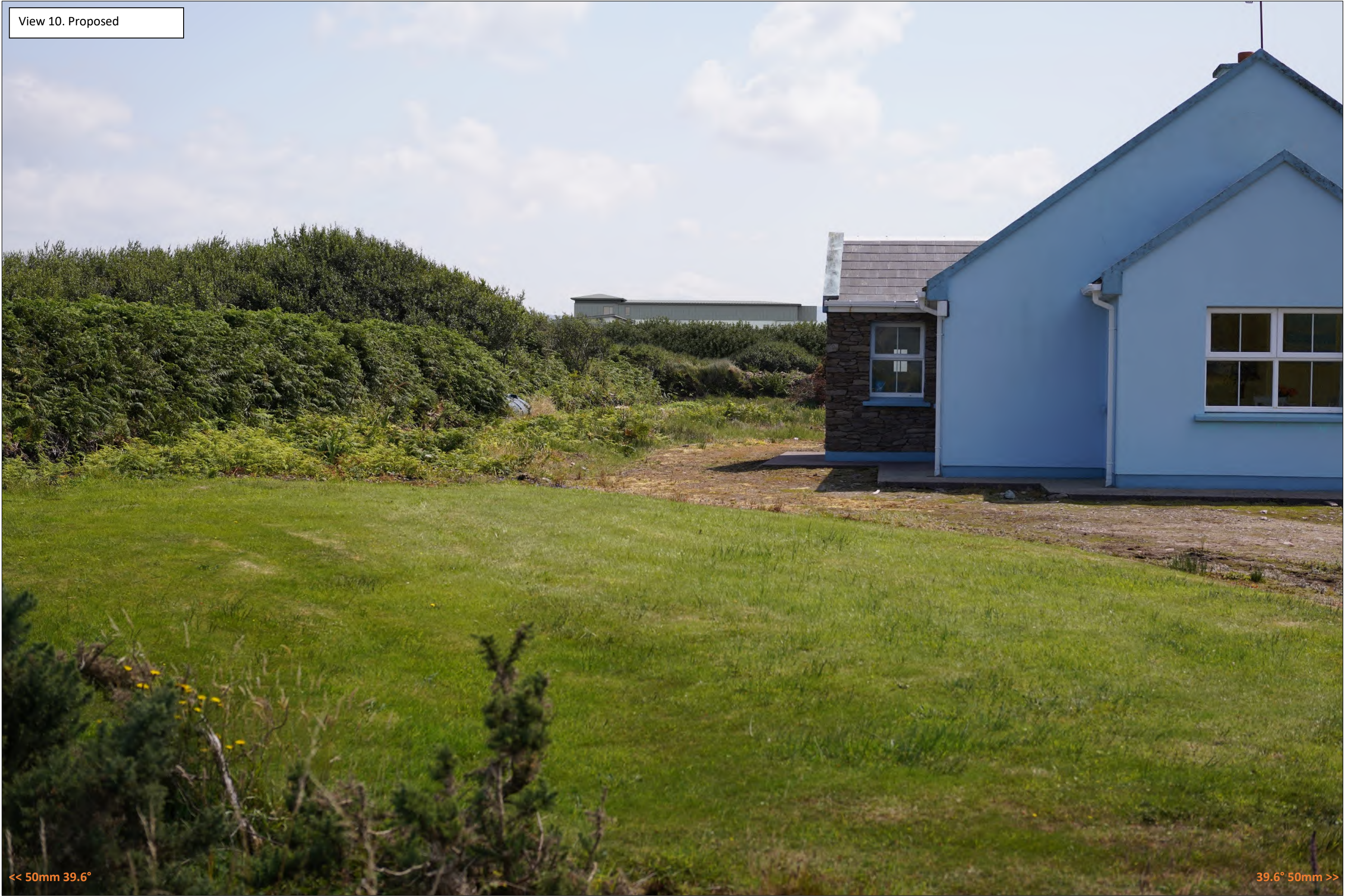
View 10. Proposed