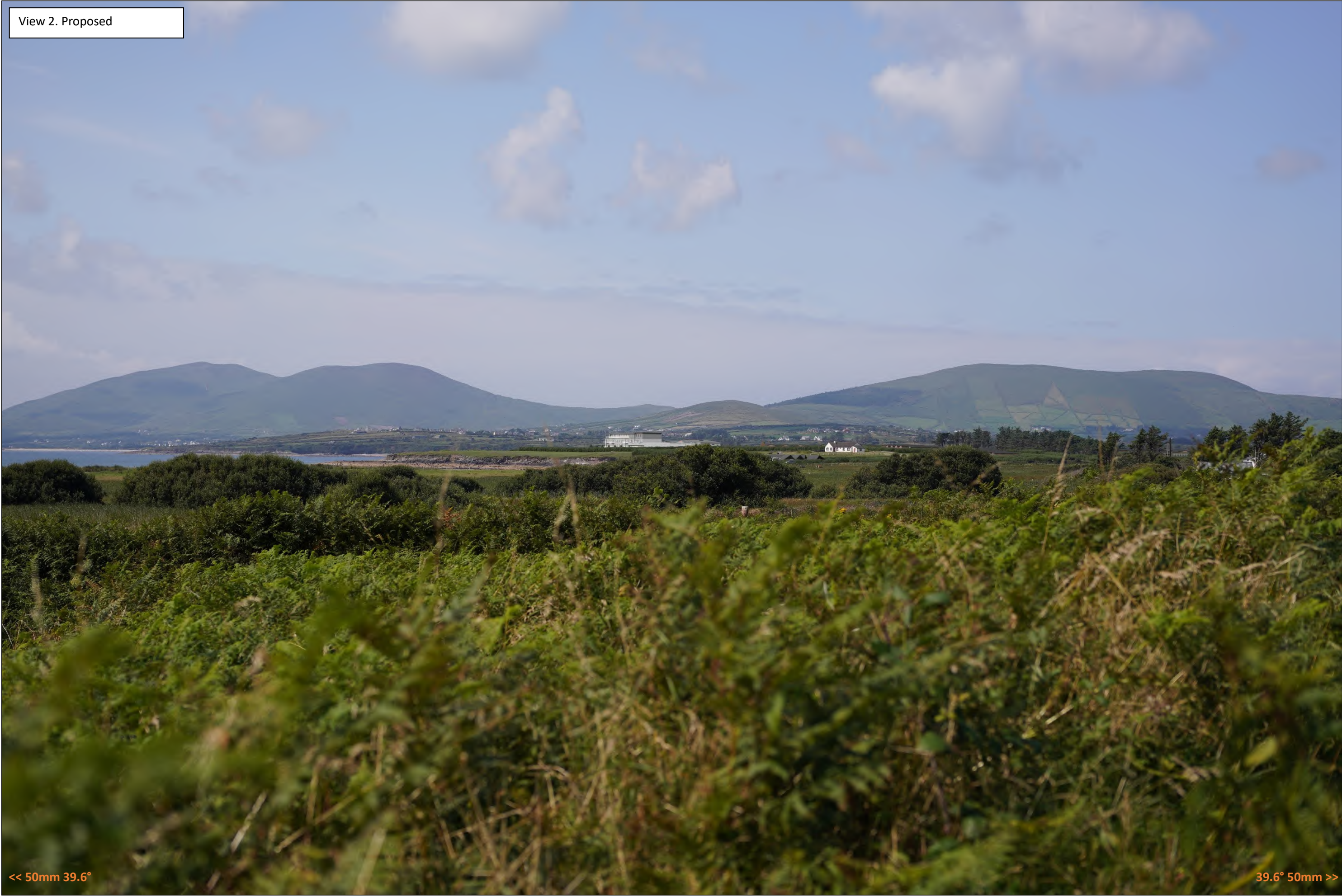
View 2. Proposed