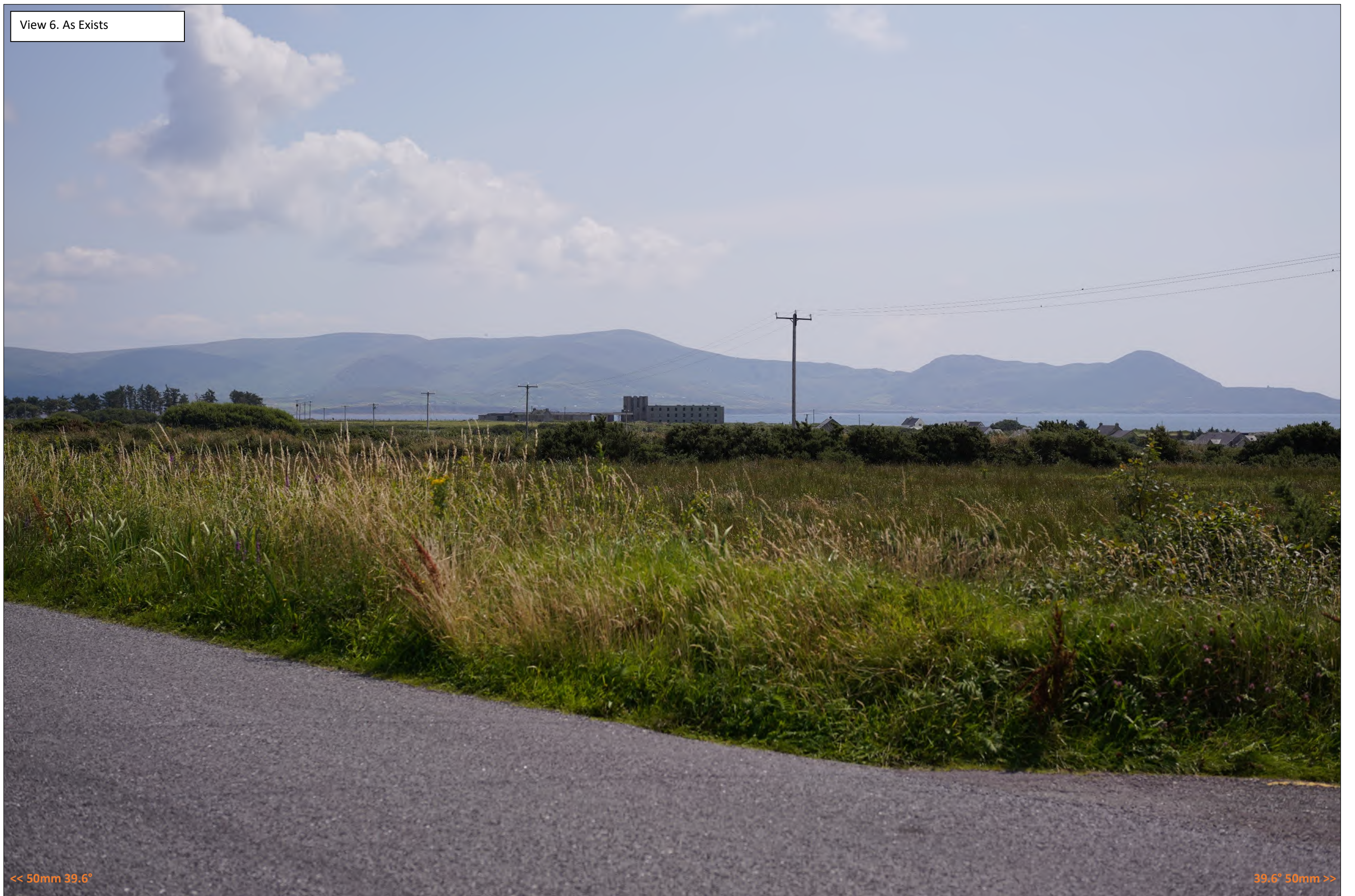
View 6. As Exists