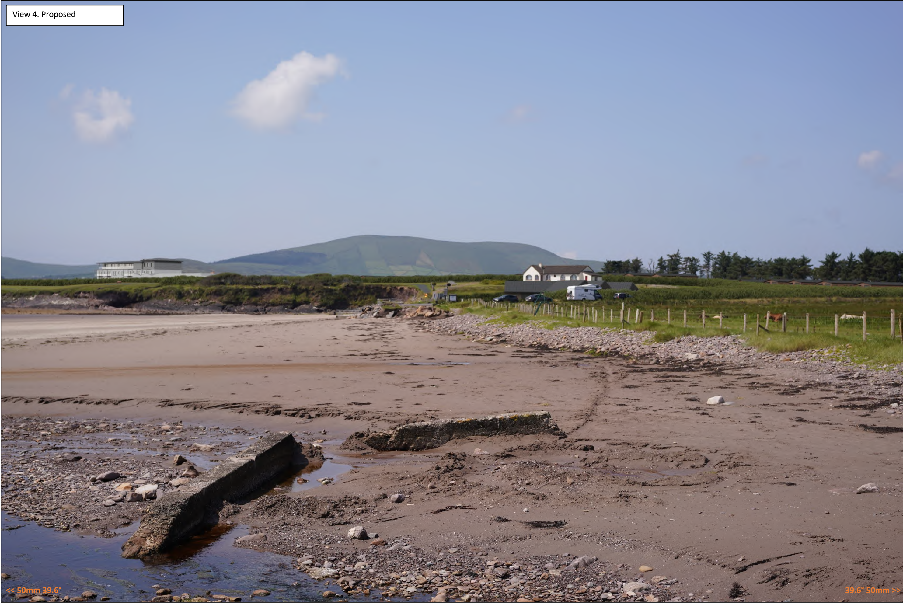
View 4. Proposed